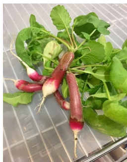
Some radishes freshly picked

The odor of fresh vegetation fills your nostrils as soon as you walk in the door. You breathe a sigh of relief that you've managed to escape the struggles of school as you scribble down names and the time in the logbook while looking at previous notes to see what you should do today. Welcome to the freight farm! Here students manage to leave the worries and struggles of school behind as they take a period off to farm. By farm, I literally mean, tend to the growth of vegetables. The freight farm contains plentiful vegetation which it often contributes to local food shelters. Students work alone or in groups as they accomplish the day's tasks with the knowledge that they are bringing healthy food to deprived people while being themselves in their stress-free time. Freight Farm allows many students to have the rare opportunity to peacefully farm during school while being in the midst of the city.